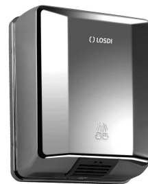
REF: CS-400-X CHROME Finish