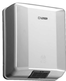
REF: CS-200-X WHITE ABS Finish