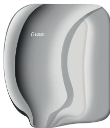
REF: CS-600-I/X BRIGHT STAINLESS STEEL Finish