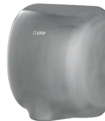
REF: CS-600-S/X SATIN STAINLESS STEEL Finish