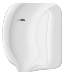
REF: CS-600-X WHITE LACQUERED METAL Finish